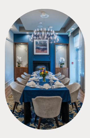
Your kitchen for the joy of cooking, our all-day bistro for the joy of not.

Host friends or family in the private dining room and leave the chores to us.